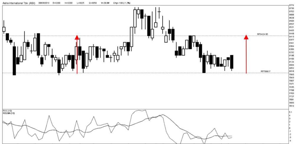
Kinerja saham ASII

Danareksa research report are also available at Reuters Multex and First Call Direct and Bloomberg